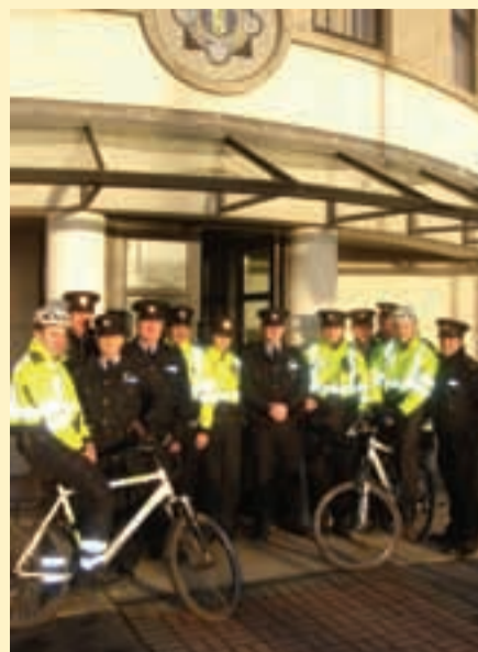
Community gardaí attached to Mayorstone Garda Station

competition in conjunction with Limerick Sports Partnership and Simpson Xavier. Students learned about cycle safety through practising on an obstacle course similar to that used on the Garda Mountain Bike course. JFK Memorial School on the Ennis Road, Limerick won the competition and was presented with the top prize of a school computer.