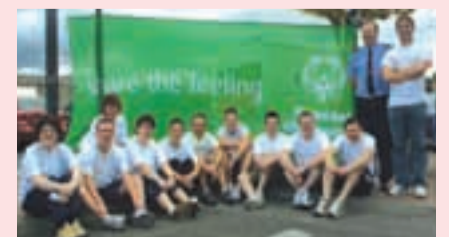
Members in Kilkenny who took part in the sponsored cycle

Waterford, Dungarvan, Kilkenny, Thomastown and Tramore Garda Districts – Kilkenny Gardaí raised €5,213 for the Special Olympics Support an Athlete Programme 2007 through two events. The first event was a table quiz in July organised by the Community Policing Unit, which raised €1,720. The second event was a sponsored cycle. Gardaí from the Community Policing Unit and regular units in the district completed the 55 kilometre route which took them through Castlecomer, Ballyragget and Freshford. The cycle raised €3,493.