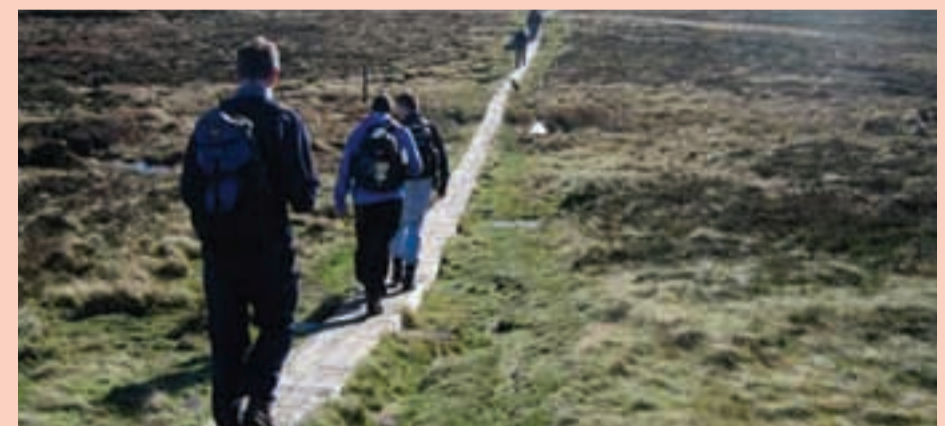
Students from DMR South walking the 'Wicklow Way'