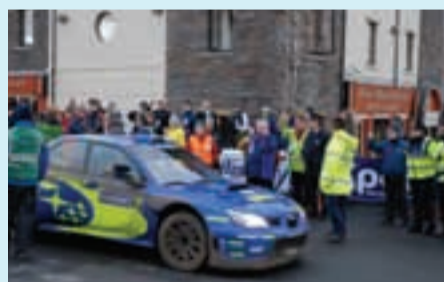
The final stretch of the rally at Mullaghmore

The largest sporting event ever held in the North West, Round 15 of the World Rally Championship , took place from 15 to 18 November 2007. The rally attracted over 250,000 people throughout the weekend. Over 500 gardaí played a crucial role in ensuring the smooth running of the event.