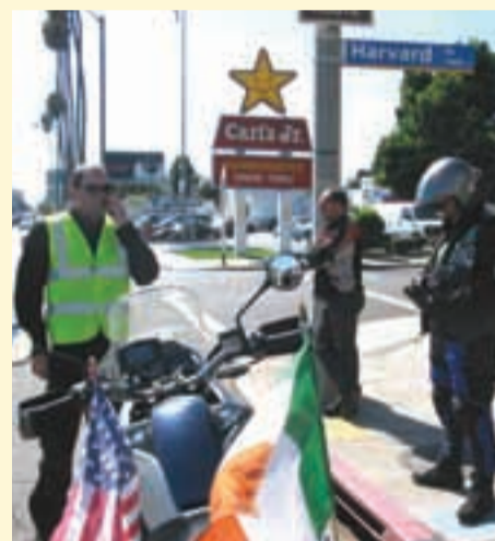
Some images from the motorbike ride along Route 66 which raised over €400,000 for UNICEF