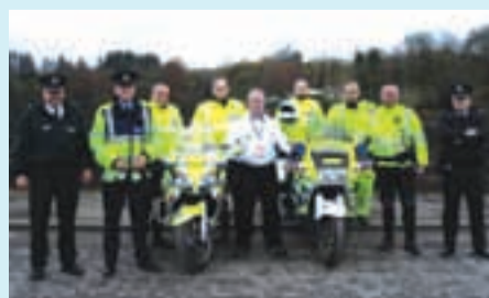
The official handover of the escort to the PSNI

Planning for the Garda operation began in May 2007 when requests were made for the deployment of personnel from the National Support Service including the Garda Air Support Unit, Garda Dog Unit, Garda Mounted