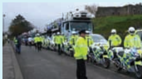
Gardaí escort the rally