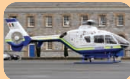
The new garda helicopter which was delivered in 2007 represents an investment of €7.6 million in the Garda Fleet

This world-class executive-level programme represents a substantial investment by An Garda Síochána in the development of its senior management team. A further group of 14 police officers including representatives from other police forces started the programme in September 2007.