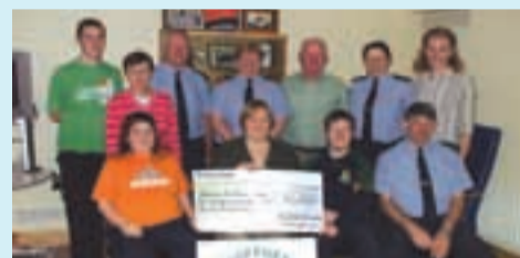
Hillwalkers from Manorhamilton District present their cheque to the Leitrim Special Olympics Committee