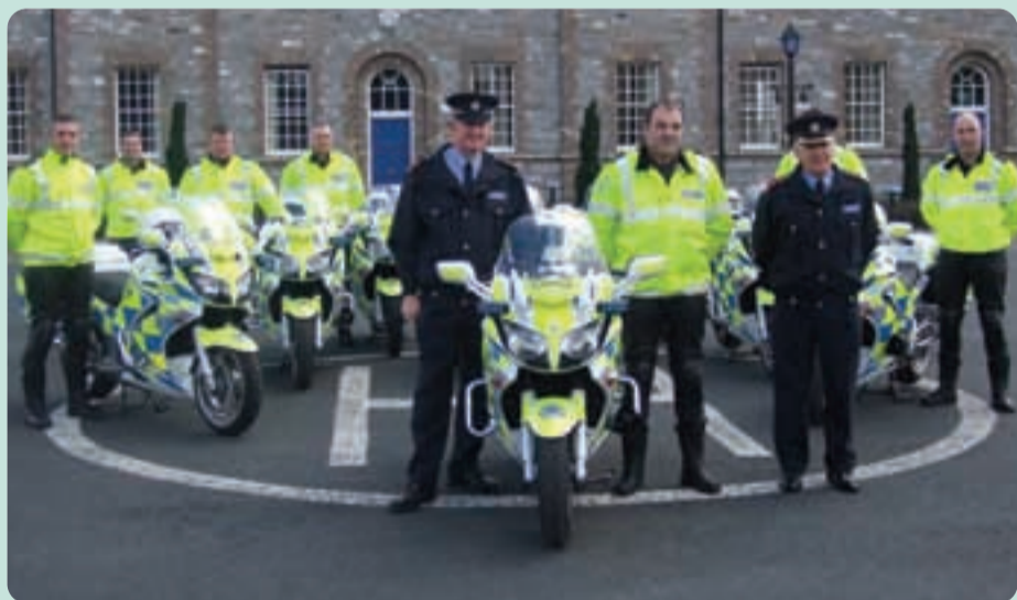
Receipt of new Yamaha FJR 1300 motorbikes which added significantly to the Garda Traffic Fleet in 2007