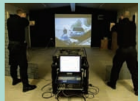
FATS in action

The introduction of FATS for authorised firearms cardholders has been very successful and it is anticipated that the remaining cardholders will receive training in the system in 2008.